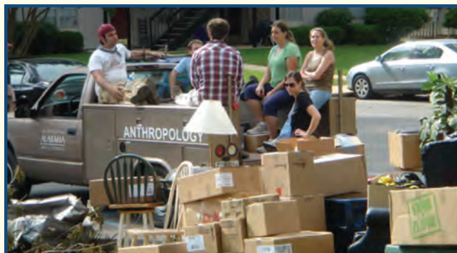
The Anthropology utility truck was the workhorse of post-tornado salvage operations in Tuscaloosa.