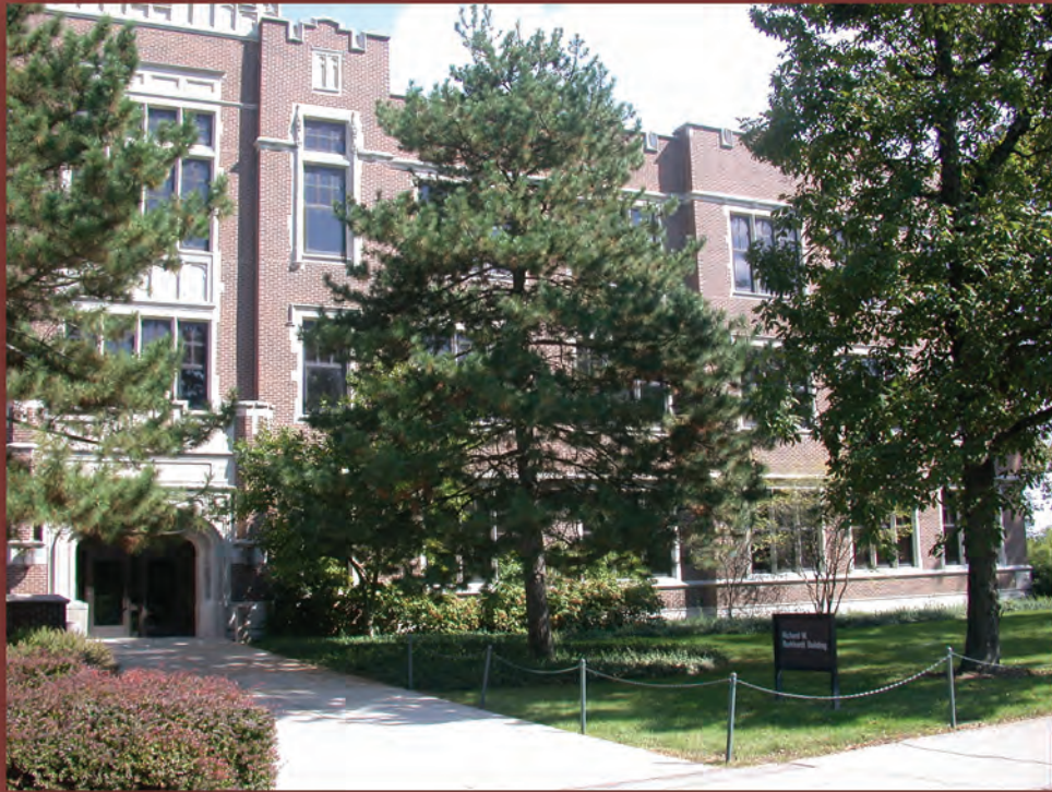
National Office of Lambda Alpha is located in the Burkhardt Building shown in this photograph, on the Ball State University campus.